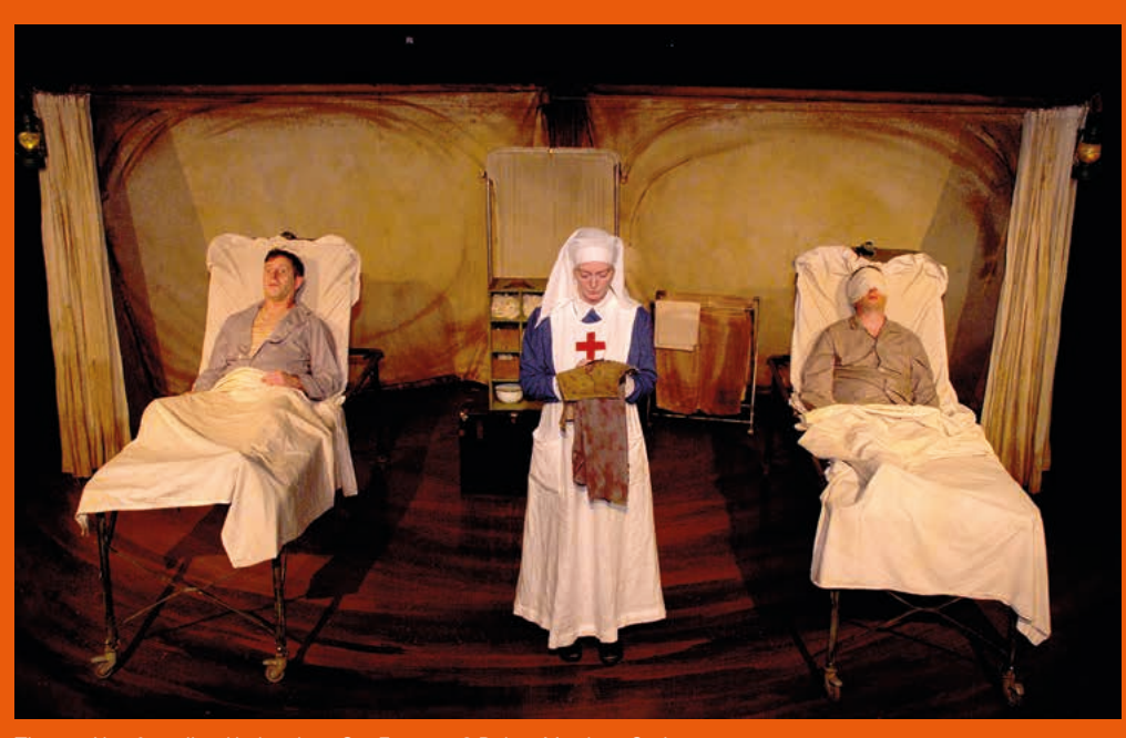
Theatre Newfoundland Labrador - Our Frances