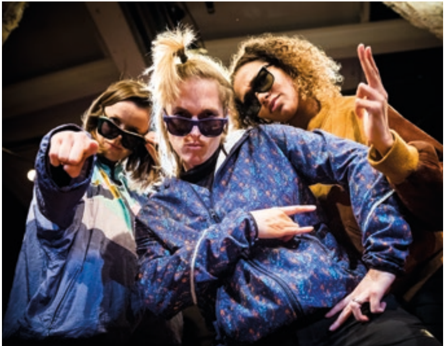
Out of Chaos Unmythable .