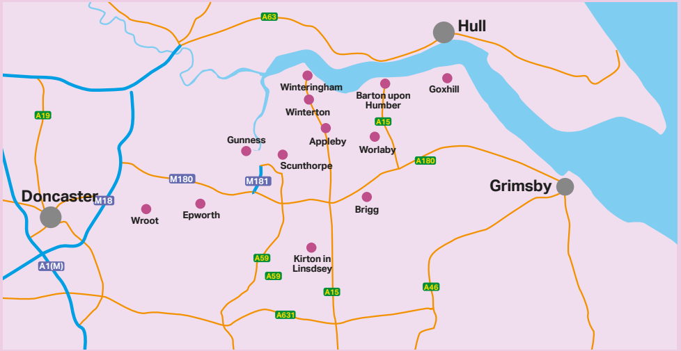
LiveLincs venues map