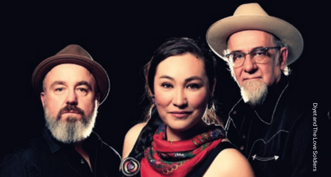
Diyet and The Love Soldiers

Bringing theatre, dance and music to a village near you