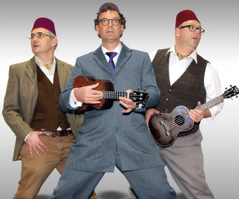
The Band Called La Bella

Bringing theatre, dance and music to a village near you